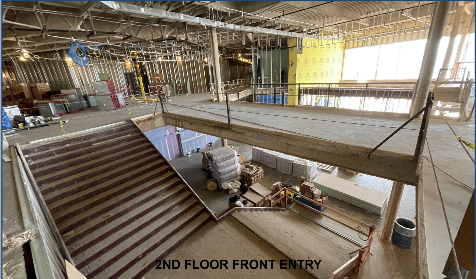
2ND FLOOR FRONT ENTRY