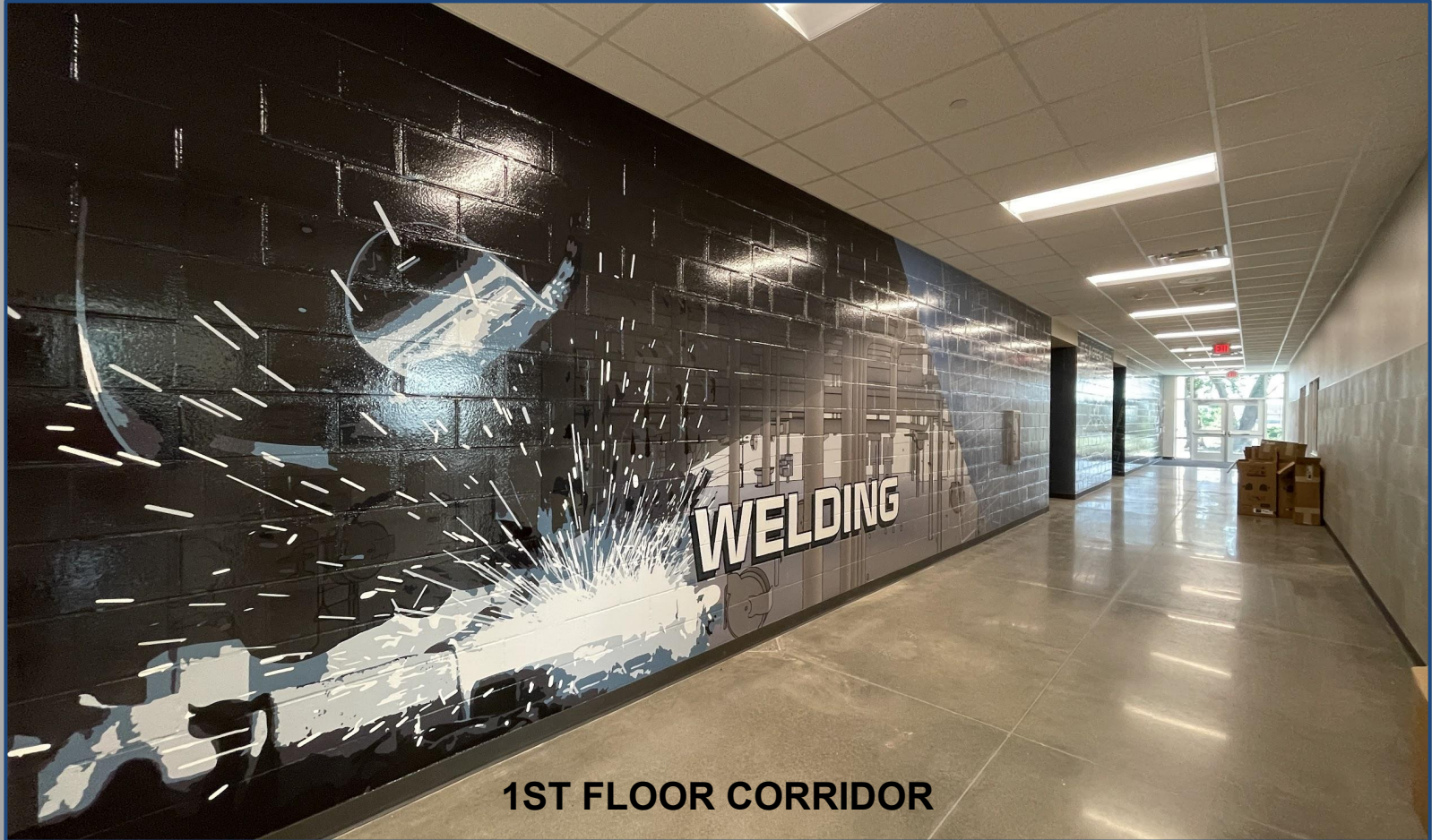
1ST FLOOR CORRIDOR