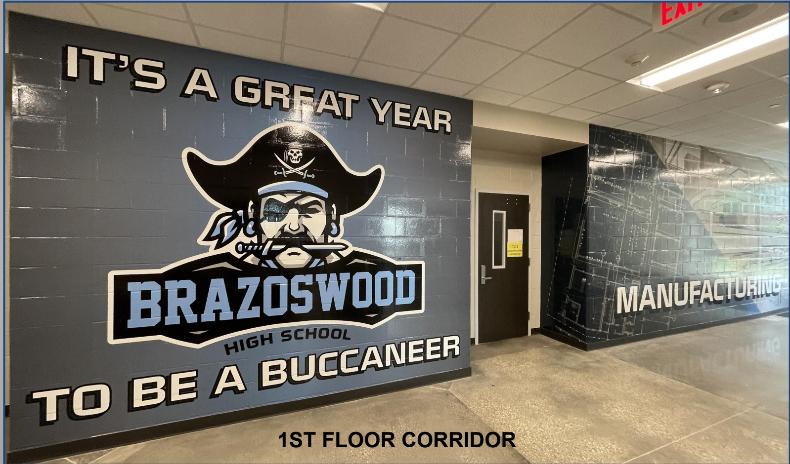
1ST FLOOR CORRIDOR