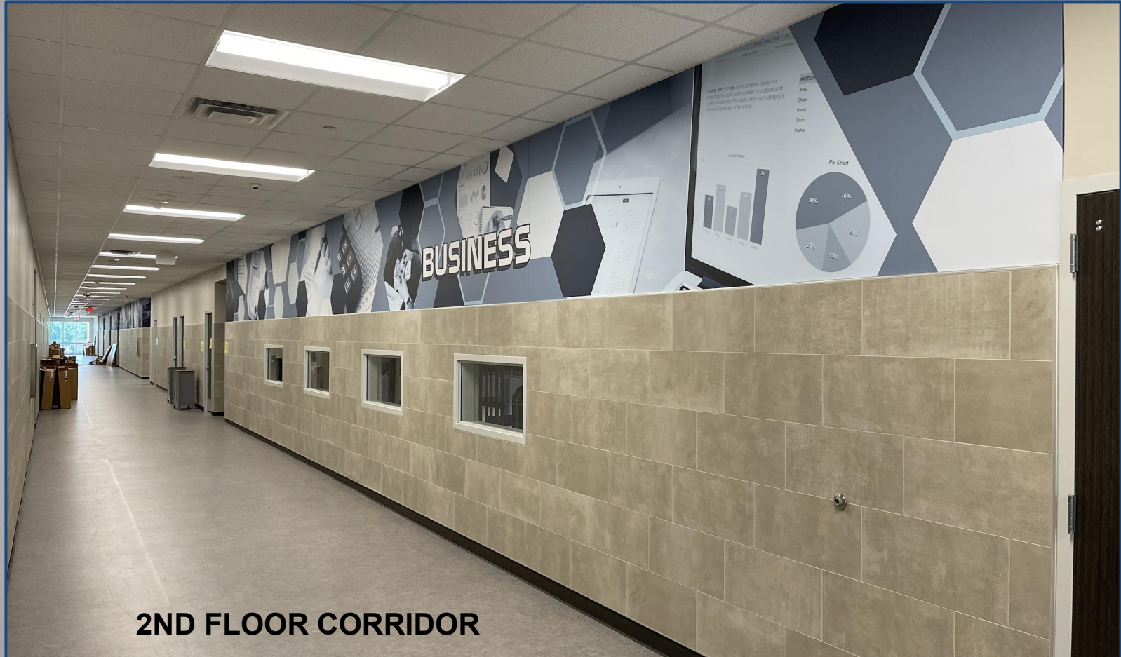
2ND FLOOR CORRIDOR