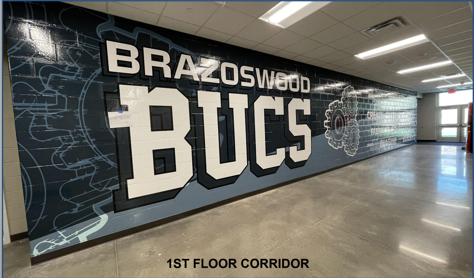
1ST FLOOR CORRIDOR