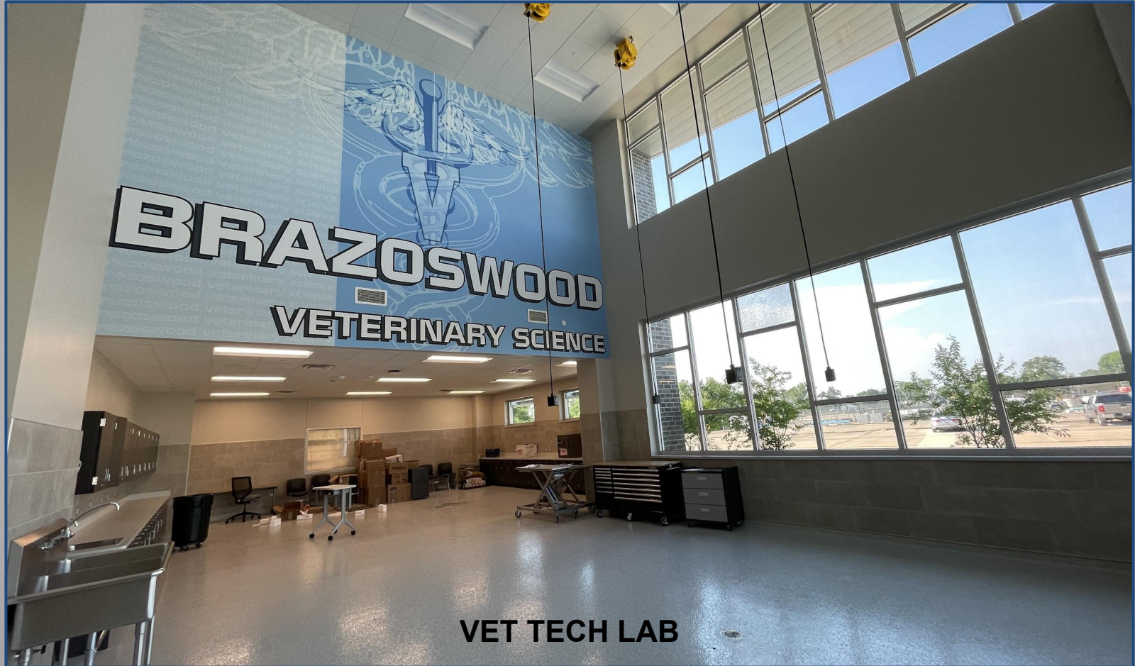
VET TECH LAB