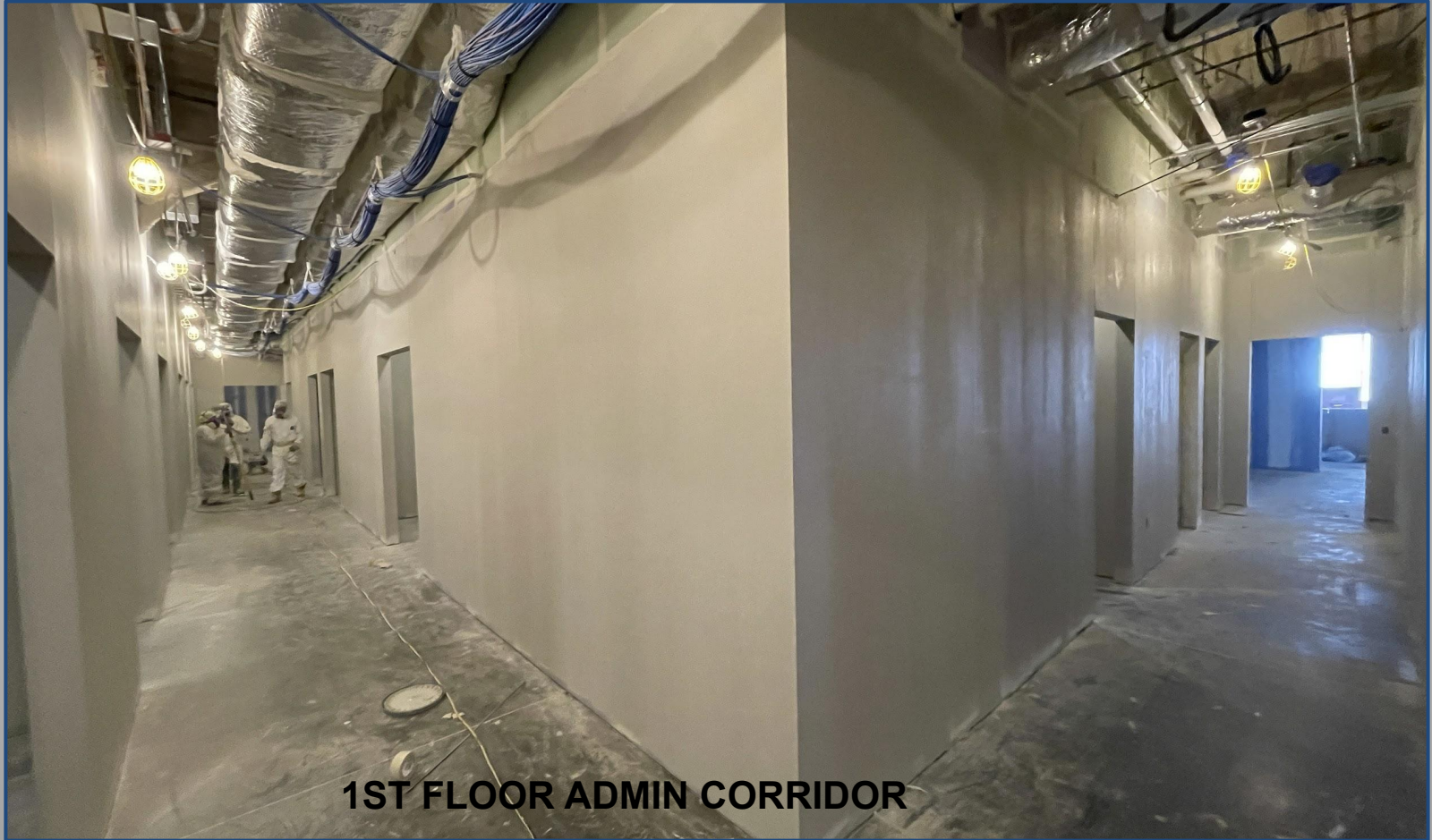
1ST FLOOR ADMIN CORRIDOR